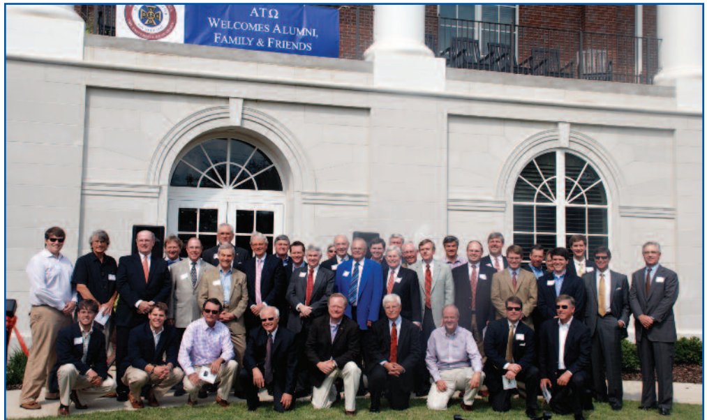
Beta Delta alumni in attendance.