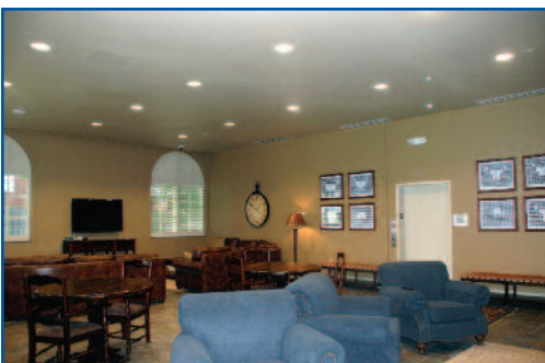
A view of the fellowship hall in the new house.